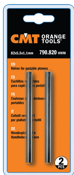
2-PCS. BLISTER CASE (790.755/790.780/790.806/790.805/790.820)