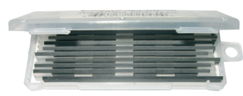
10-PCS. CASE (MINIMUM ORDER)